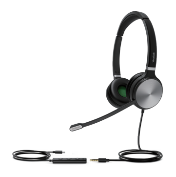
UH36 Dual Teams UH36 Dual UC