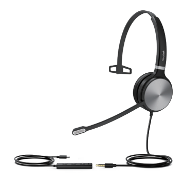
UH36 Mono Teams UH36 Mono UC

Deeply integrated with Yealink IP phones that the advanced features, such as volume synchronization and multiple calls control, are just right at your fingertips.